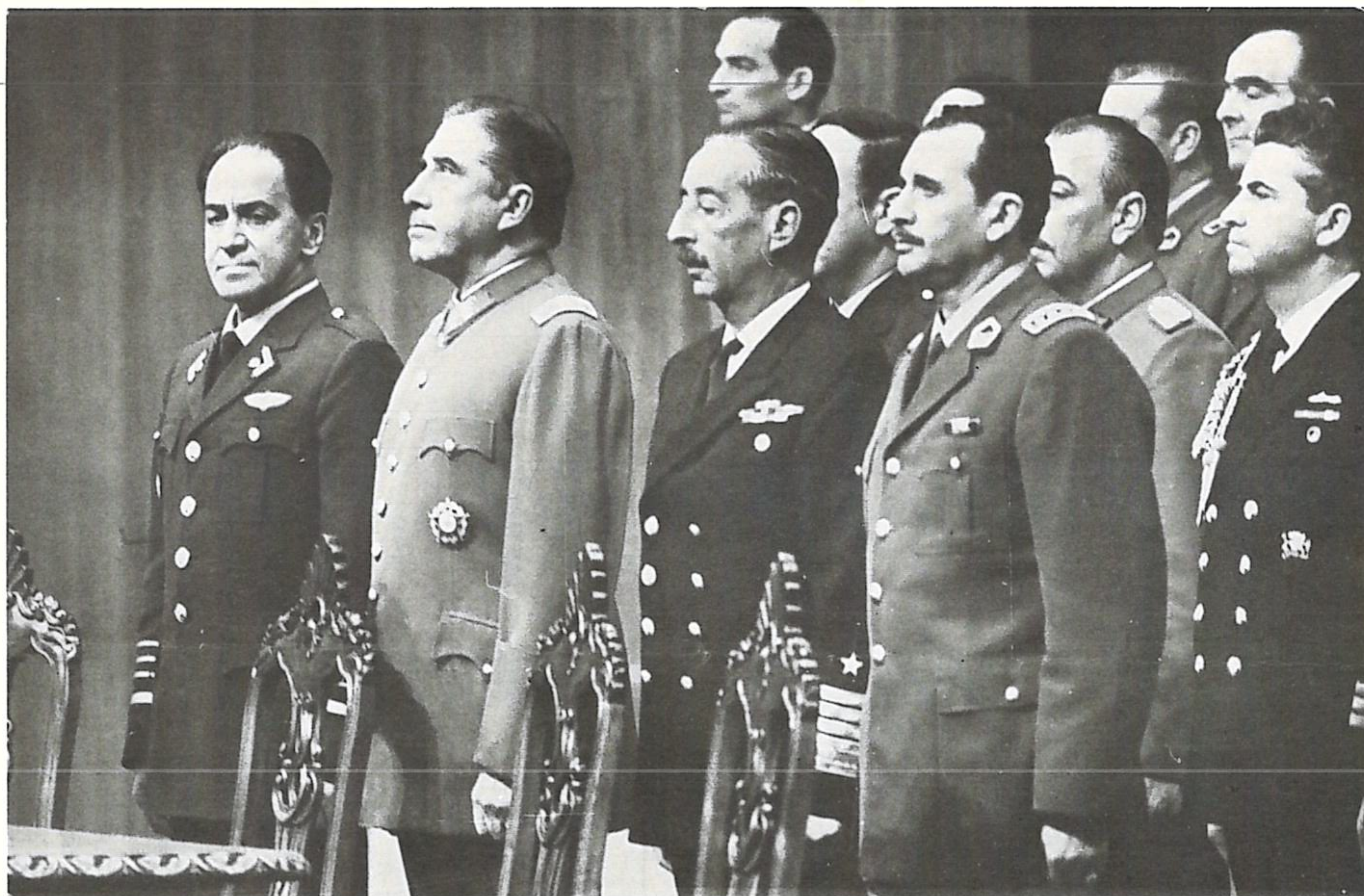
The new Chilean Government "Junta", September 1973, reading from left to right:— General del Aire (Air Marshal) Commander-in-Chief of the Chilean Air Force GUSTAVO LEIGH; Commander-in-Chief of the Army and President of the "Junta", General AUGUSTO PINOCHET; Vice-Admiral and Commander-in-Chief of the Chilean Navy, JOSE TORIBIO MERINO C. Director General of Carabineers (Police) CESAR MENDOZA