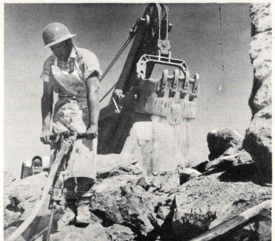
Drill & Mechanical Shovel at Chuquicamata