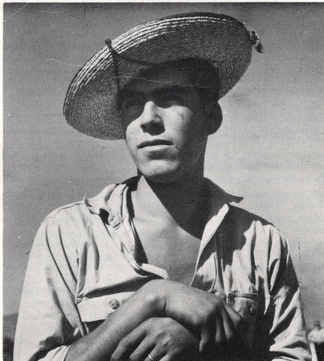
Chilean farm hand in wine growing region of Chile.

Members of the Anglo-Chilean Society, including ladies, who have not previously participated in this annual event and who would like to play this year are invited to send in their names to the Secretary, 3, Hamilton Place, London W.1.